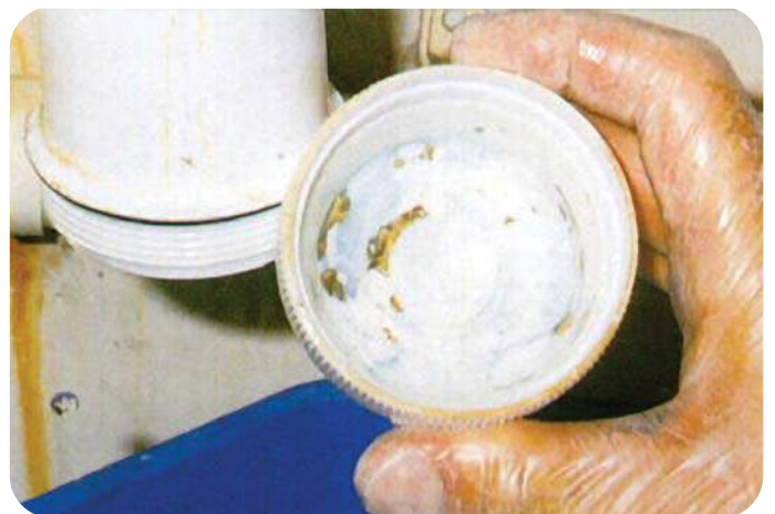
with Bio Blocks

Bio Blocks do not contain pDCB or other dangerous chemicals and are particularly suitable for use in public buildings, schools, institutions, hotels, pubs, clubs and restaurants. The pictures above show two urinal outlets after six months use - one using Bio Blocks, the other no blocks at all.