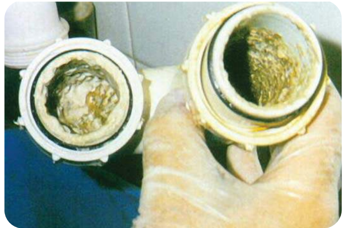
without Bio Blocks

Bio Blocks (not money) down your drains this year.